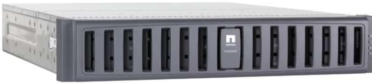
Figure 1) FAS2040 system.