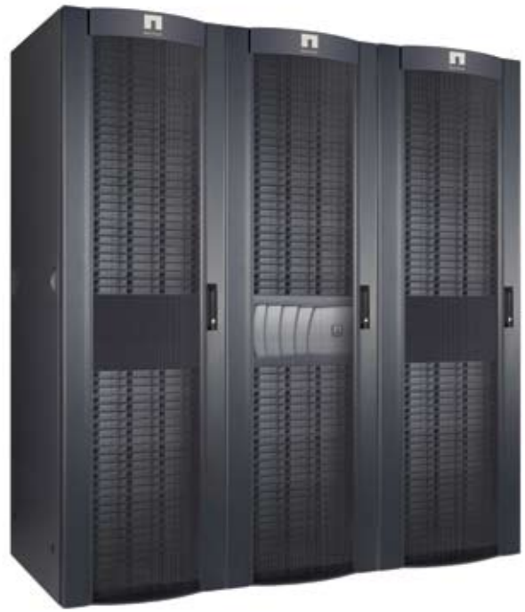
Figure 2) FAS3140 system.

Snapshot technology to provide you with incremental block-level synchronous and asynchronous replication. SnapVault®, in contrast, uses our Snapshot technology to perform block-level incremental backups of your data to another system. You can be assured of consistent backup images and application-level recovery in minutes when you use our host-based SnapManager® software, which integrates Snapshot management with your applications.